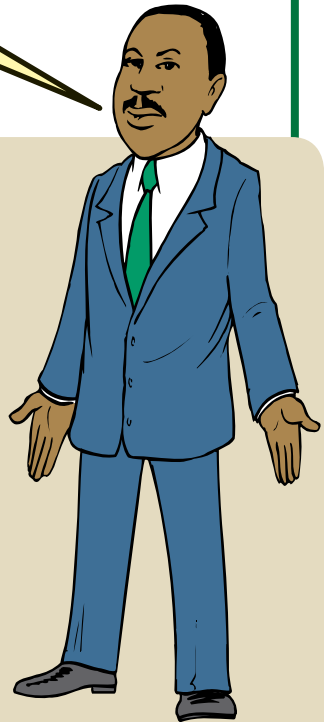
Dr. Martin Luther King, Jr.

"We must use time creatively... and forever realize that the time is always ripe to do right."